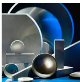
Ceramics and materials