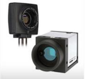
Imaging and cameras